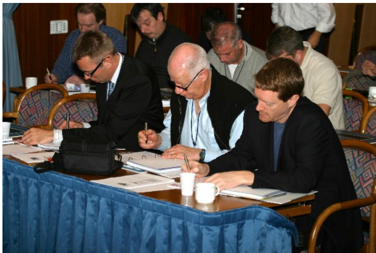
Class Attendees: Applying Newly-Learned Skills ("Brainware")

Our training classes are designed to maximize the return on investment you sought in buying a NAV solution.